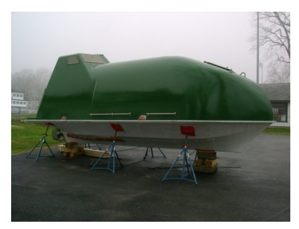
Figure 2. Maine Maritime Academy's Hybrid "Green Ship" Prototype

In 2010, a research team, comprised of Maine Maritime Academy (MMA) and the University of Maine (UMaine), designed and fabricated a unique, thermoelectric hybrid vessel from an encapsulated lifeboat to serve as a dedicated test platform. The lifeboat was retrofitted with a new diesel electric propulsion system featuring a C2.2 Caterpillar genset and a 22 kW electric motor. In order to meet the requirements of hybrid classification, the energy recovered by the thermoelectric generator (TEG) is reintroduced into the propulsion system thereby reducing the load on the generator set. Conversion of the variable DC output of the TEG to a stable AC source was accomplished with a specialized micro-inverter that accepts the low voltage DC, converts it to AC, and acts as a transformer by stepping up the voltage to a higher and more practical level for usage onboard ships. By the end of the summer of 2010, this hybrid vessel made her maiden voyage in a cruise around the harbor in Castine, Maine. An illustration of MMA's hybrid "Green Ship" is depicted below in Figure 2.